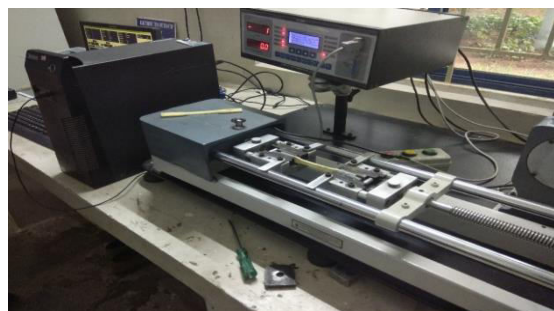
Fig 1.3 Tensile test

The tensile, flexural and impact strength of polymer composite was tested by using the Strain controlled UTM based on ASTM standards shown in figure. The size of 165mm X 19mm X 13mm for tensile, 50mm X 13mm for impact and 50mm X 13mm flexure (as per ASTM standard size).