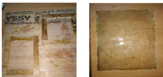
Fig 1.1 Polymer composite

It manages the manufacture stages used to acquire the composite material. The means associated with Hand-Lay-Up strategy for advancement of fiber fortified composite is same for the manufactured filaments. There are eight states of FRP overlays are utilized here in like manner aramid, nylon and glass with various grams per square meter for FRC and HFRC covers. By setting up a form in 150mm X 200mm X 15mm putting with overhead projector sheet and remover for simple to evacuate and dealing with the overlay shows in fig 1.1. Planning of epoxy framework by 1:10 proportion connected at base layer of form. For FRC overlays applying single fiber tangle with shape measurement and furthermore for HFRC covers utilizing diverse fiber mats with form measurement used to submerged by epoxy gum. Again applying epoxy network up to the level secured with overhead projector sheet and curing at room temperature for two days. The testing of FRC and HFRC laminates are done with the help of ASTM standards, before testing the laminates shown in figure 1.2