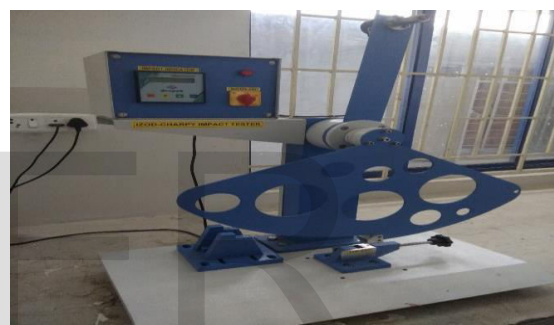
Fig 1.4 Impact test