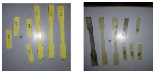
Fig 1.2 ASTM standard laminates