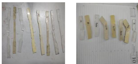
Fig 1.6 Tested Laminates

The tested laminates are shown in fig 1.6 also the difference between load and deflection of HFRC laminates shown in figure 1.7.