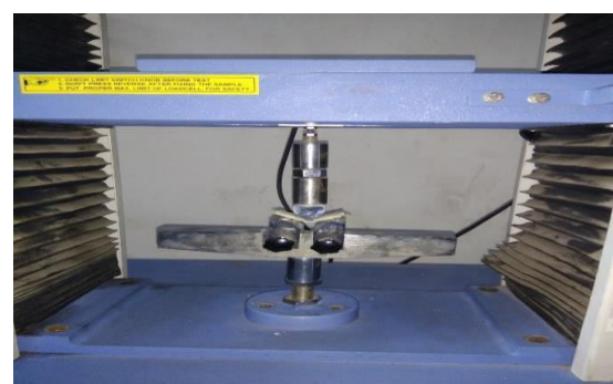
Fig 1.5 Flexural test

The outcomes were depicted aramid fiber is great in quality however not great in prolongation. For this situation Nylon strands gives a decent outcome in stretching yet not all that well in quality. By the blend of aramid and nylon HFRC composite not give a normal outcome as a result of holding issues. So by getting ready glass filaments like 200 and 400 GSM overlays with aramid and nylon textures give a superior come about by looking at different